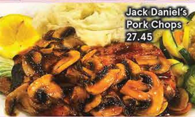
Jack Daniel's Pork Chops 27.45