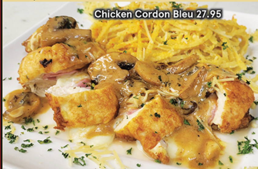
Chicken Cordon Bleu 27.95

Chicken Cordon Bleu 27.95 Breaded chicken breast stuffed with ham & mozzarella cheese, topped with a creamy mushroom sauce over pasta