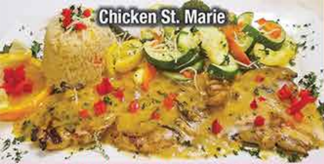
Chicken St. Marie