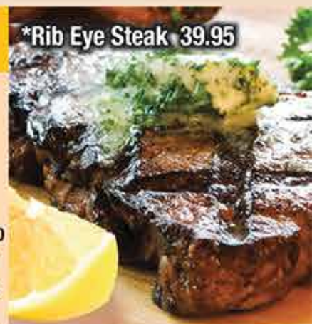
*Rib Eye Steak 39.95

Flavorful skirt steak (18 oz.) served with fried onions