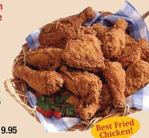
Best Fried Chicken!