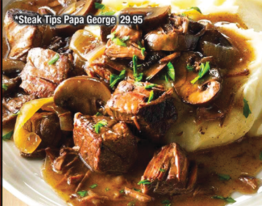
*Steak Tips Papa George 29.95

M. D. Famous Chef's Salad Bowl 20.95 White meat turkey, roast beef, ham, American and Swiss cheese and hard boiled egg over mixed green salad with tomatoes