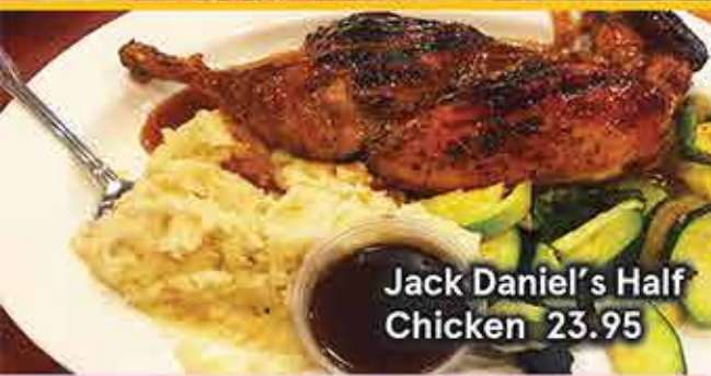
Jack Daniel's Half Chicken 23.95

Country breaded and fried golden. Served with country gravy & mashed potatoes