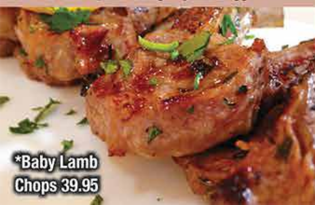
*Baby Lamb Chops 39.95

*Steak Bourbon 39.95 NY Strip steak (16 oz.), mushrooms & onions in a light brown bourbon sauce served with mashed potatoes, gravy and veggies