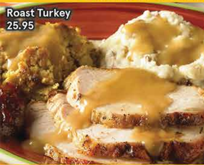
Roast Turkey 25.95