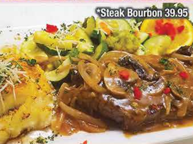
*Steak Bourbon 39.95