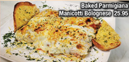
Baked Parmigiana Manicotti Bolognese 25.95