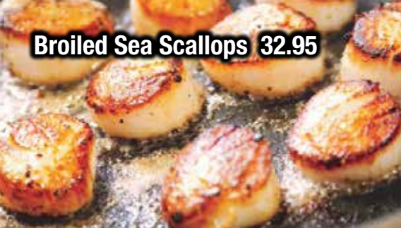
Broiled Sea Scallops 32.95

With lemon butter sauce on a bed of rice