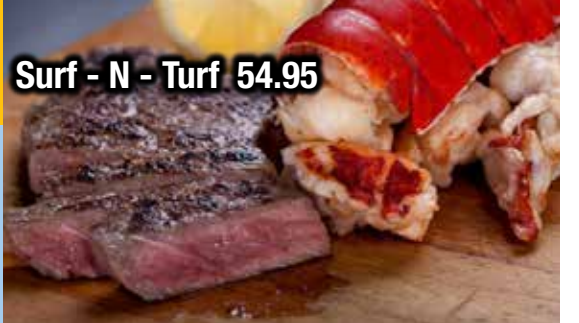
Surf - N - Turf 54.95

Broiled fillet of flounder, shrimp, scallops, fillet of salmon and stuffed mushroom