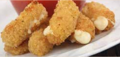
Mozzarella Sticks (6) 12.45 with tomato sauce