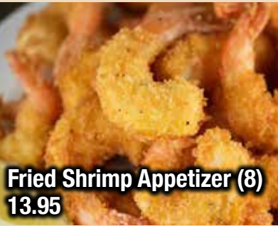
Fried Shrimp Appetizer (8) 13.95