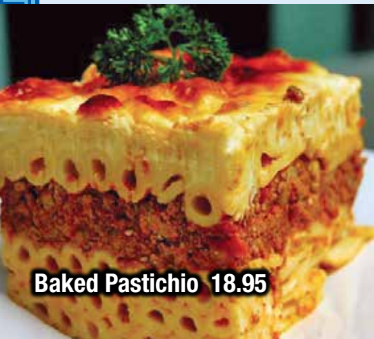
Baked Pastichio 18.95

With tomato and onion on pita bread served with Greek salad and french fries