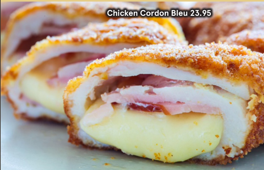
Chicken Cordon Bleu 23.95

Chicken Cordon Bleu 23.95 Breaded chicken breast stuffed with ham & mozzarella cheese, topped with a creamy mushroom sauce over pasta