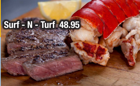
Surf - N - Turf 48.95

Broiled fillet of flounder, shrimp, scallops, fillet of salmon and stuffed mushroom