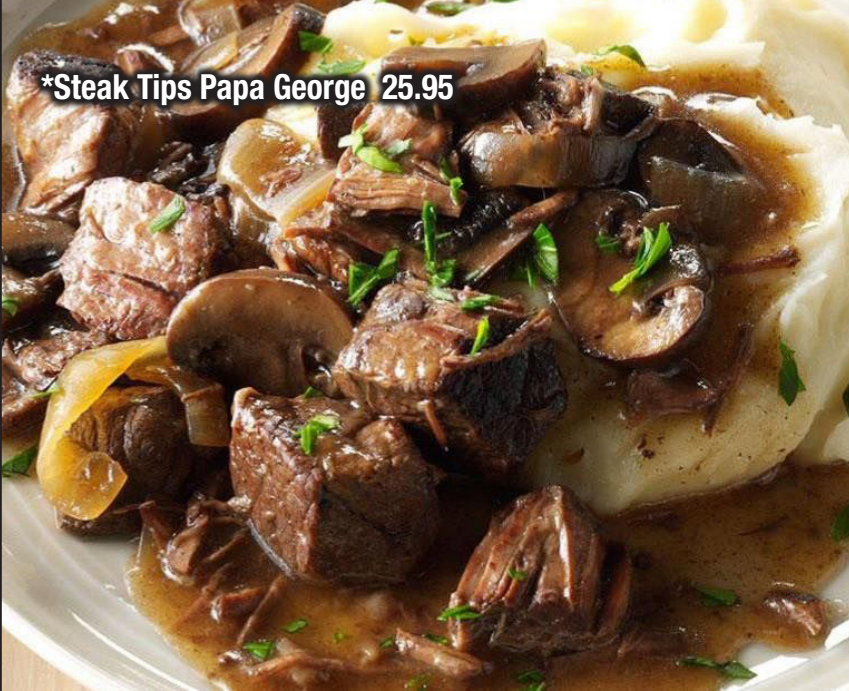
*Steak Tips Papa George 25.95