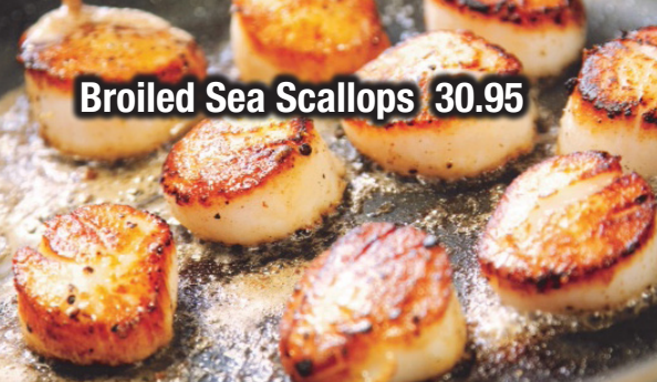
Broiled Sea Scallops 30.95

With lemon butter sauce on a bed of rice